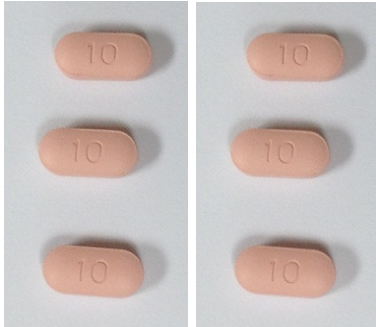
Ribavirin 200 mg tabs – 3 tabs in AM, 3 tabs in PM

*you must stay in very good contact with _____ or your pharmacy to make sure you receive all medications on time and don't miss any doses due to shipping or approval delays*_